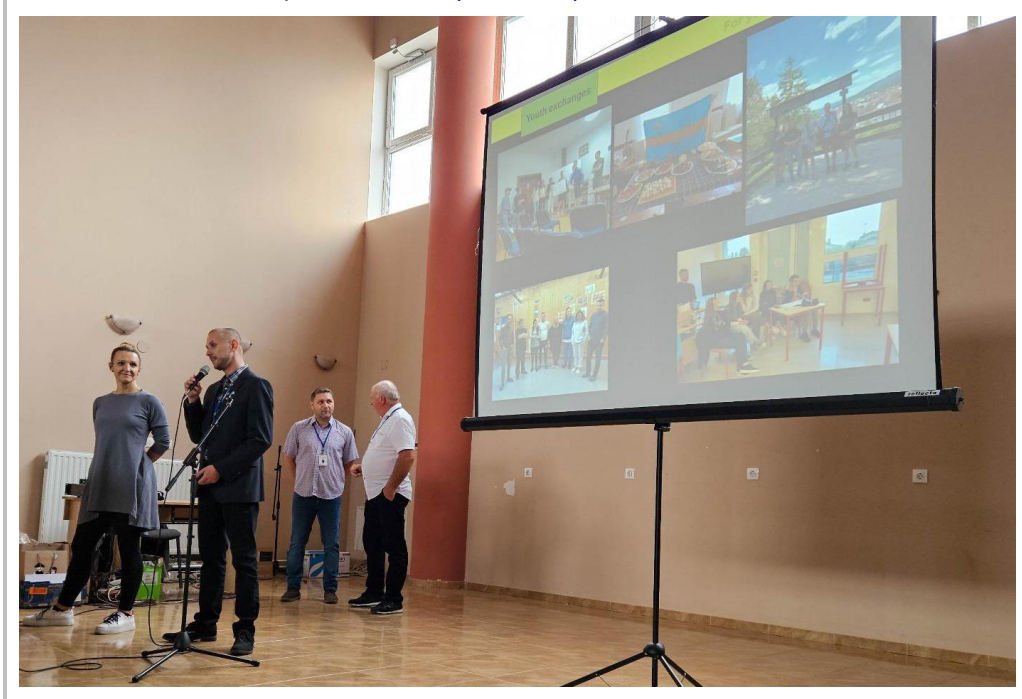
Pro Schola Associaton: <a href="https://www.facebook.com/bodpetertanitokepzokezdivasarhely">https://www.facebook.com/bodpetertanitokepzokezdivasarhely</a>