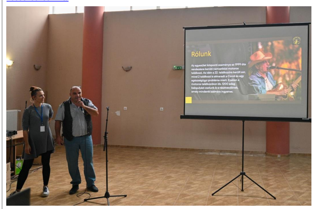
Local handcraft association: <a href="https://www.facebook.com/share/p/x4T7yEbgsBoFih2Y/">https://www.facebook.com/share/p/x4T7yEbgsBoFih2Y/</a>